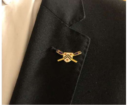
The new NCBC lapel pin

presented to rowers leaving the Boat Club at Eights Dinner each year to welcome them into the alumni community. Current alumni will be presented with one when they attend any NCBC event, and we hope to gradually make it a universal symbol of the Boat Club among Old Members.