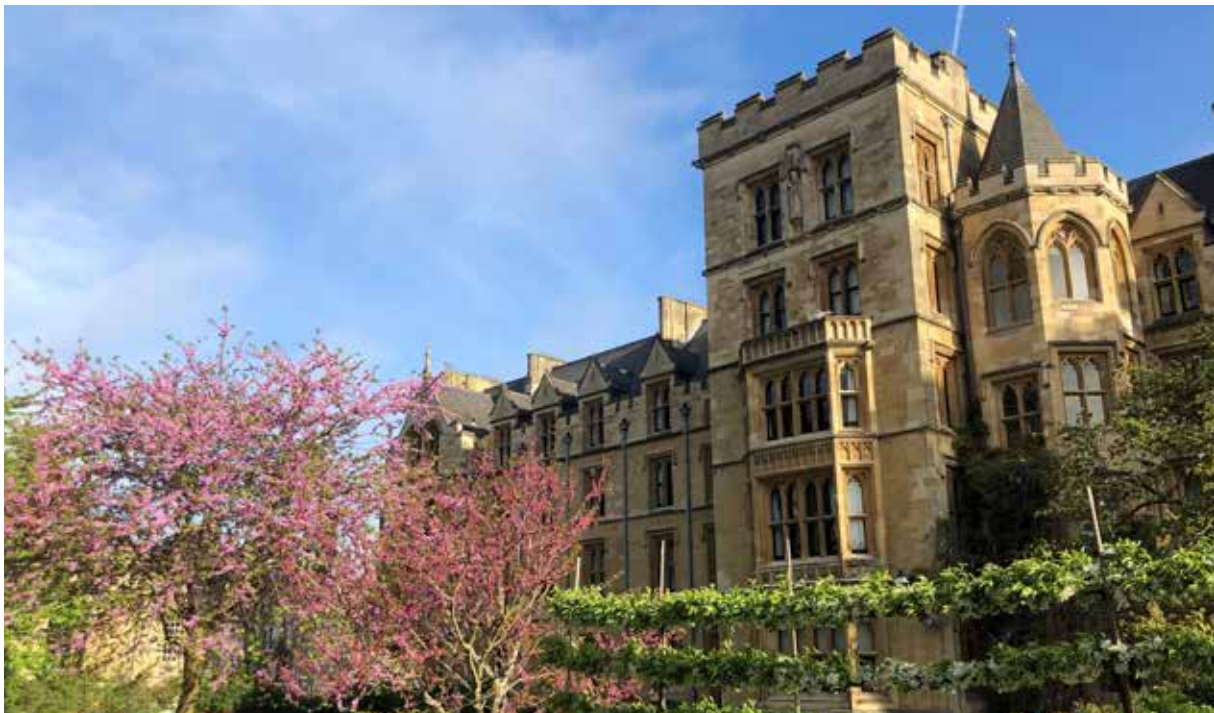
New Buildings, College View

If access to your accommodation is required for routine maintenance or repairs, we will endeavour to give you at least 24 hours' notice (except in the case of emergencies).