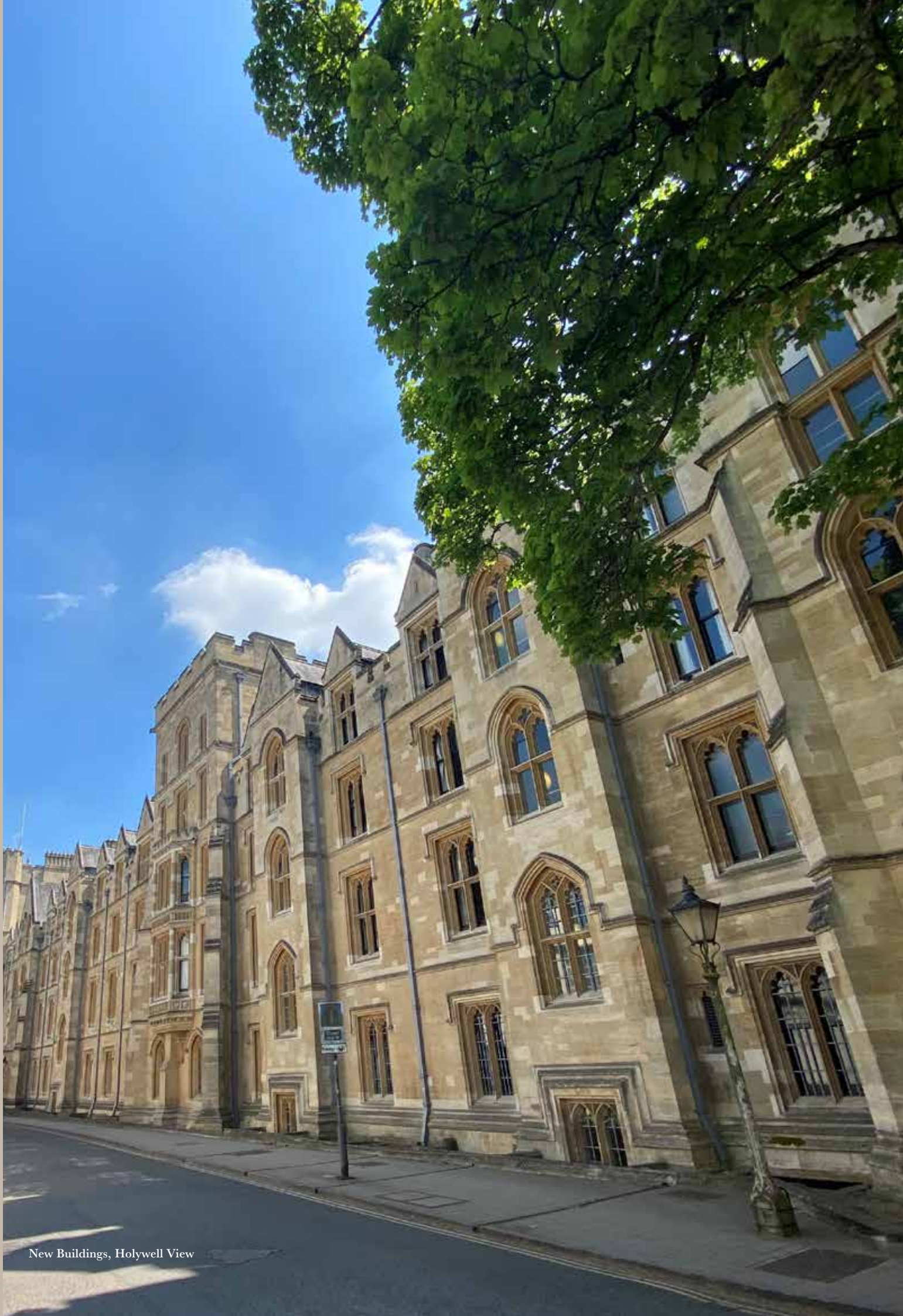
New Buildings, Holywell View