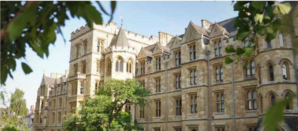
New Buildings, College View