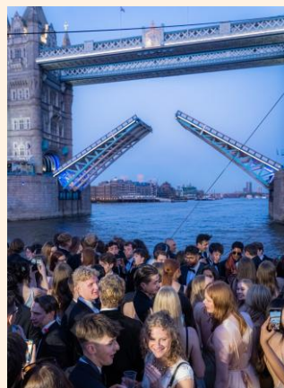
ID: New College students in black tie for the Boat Party by Tower Bridge!