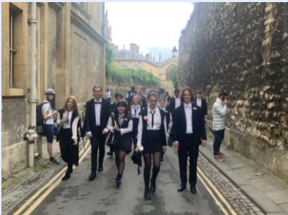
Fresher historians on their way to their exams