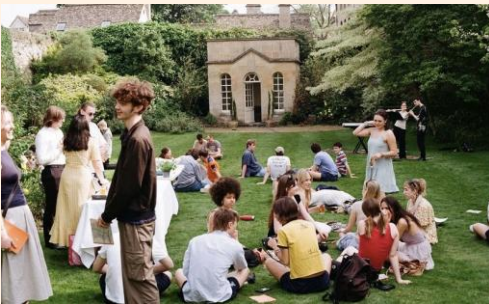
ID: The end on New College Arts Week 2024 in the Wardens gardens

Follow the arts page on Instagram: @artsnewcollege