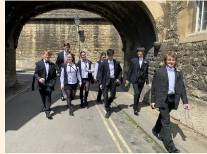
ID: New College students, in sub fusc, on their way to their exams

Prelims and Mods are the first public examinations, held at the end of Trinity (Summer) term for most subjects and at the end of Hilary (Easter) term for Lawyers. Classicists will have Mods in Hilary of their 2 nd year. These exams don't count towards your final degree grade but you do need to pass! Aim to do the best you personally can — exams are your chance to show off all you have learnt through the year.