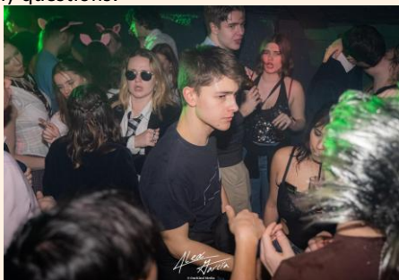
ID: NC students enjoying a BOP in Plush, this theme was British icons, see if you can guess who people dressed as