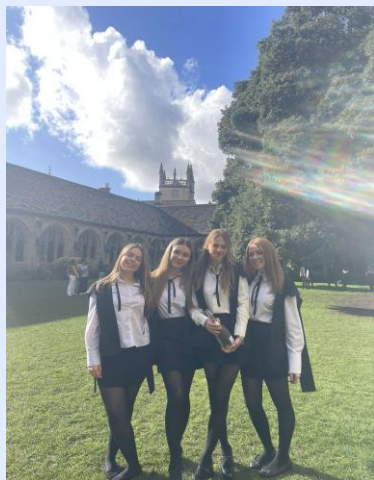
ID: Pictures of New College Freshers on Matriculation Day, wearing sub fusc