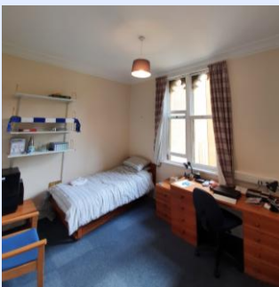
ID: Standard first-year room, showing bed, bedside table, chairs, minifridge and shelving

You'll have access to laundry facilities, meals three times a day in Hall, and IT facilities such as printing. You won't have access to a kitchen, but it's still possible to make some food in your room.