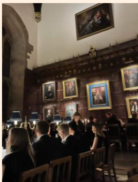
ID: New College '22 Freshers' Formal

n.b. Guest night is booked through the same system as formal hall.