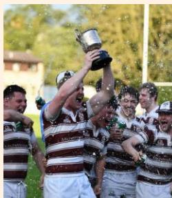
ID: New College RFC celebrating after winning cuppers in 2024