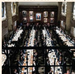
ID: New College Freshers' Formal, a great experience in Freshers' week

However, sometimes you might rather not speak to other students about your welfare concerns, so the College have multiple staff members who can help. The Cox and Salvesen fellows , who live in College, are great people to go to, offering a listening ear and advice where possible. There are also staff for academic concerns, for example, if you are struggling to balance the workload with a social life.