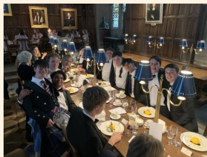
ID: NCBC members enjoying their post-Summer Eights formal