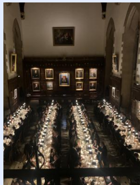
ID: The New College Hall