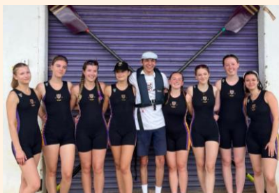
ID: NC W2 after their 2025 summer eights campaign

Another perk provided by College is free access to the Iffley Gym, which is about a 20-minute walk from College.