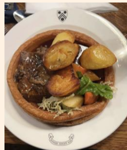
ID: An exemplary formal main course: beef roast served in a huge Yorkshire pudding!

Early hall (informal): 5:30-7:00pm every day (except formal days when it is still offered but finishes at 6:30pm)