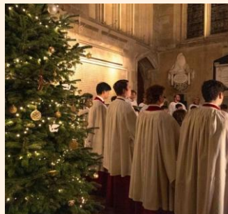
ID: NC Christmas Carol service 2024

Freshers' week is a whirlwind; leaving home, meeting new people, overwhelming. Expect highs and lows - it's normal to feel tired and uneasy. This will also be true for Oxford life in general. However, there are many people that can help regardless of your concern. The LGBTQ+ Rep, the Disabilities Rep, the Faith and Ethnic Minorities Rep, Outreach and Inreach Officers and the Peer Supporters are always willing to listen. The College also has peer supporters which are students that have undergone thorough training in order to best listen to your concerns.