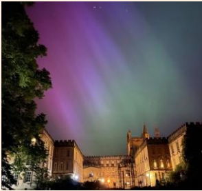
New College's natural environment is second to none! Left, Garden Quad featuring the Northern Lights. Right, Cloisters