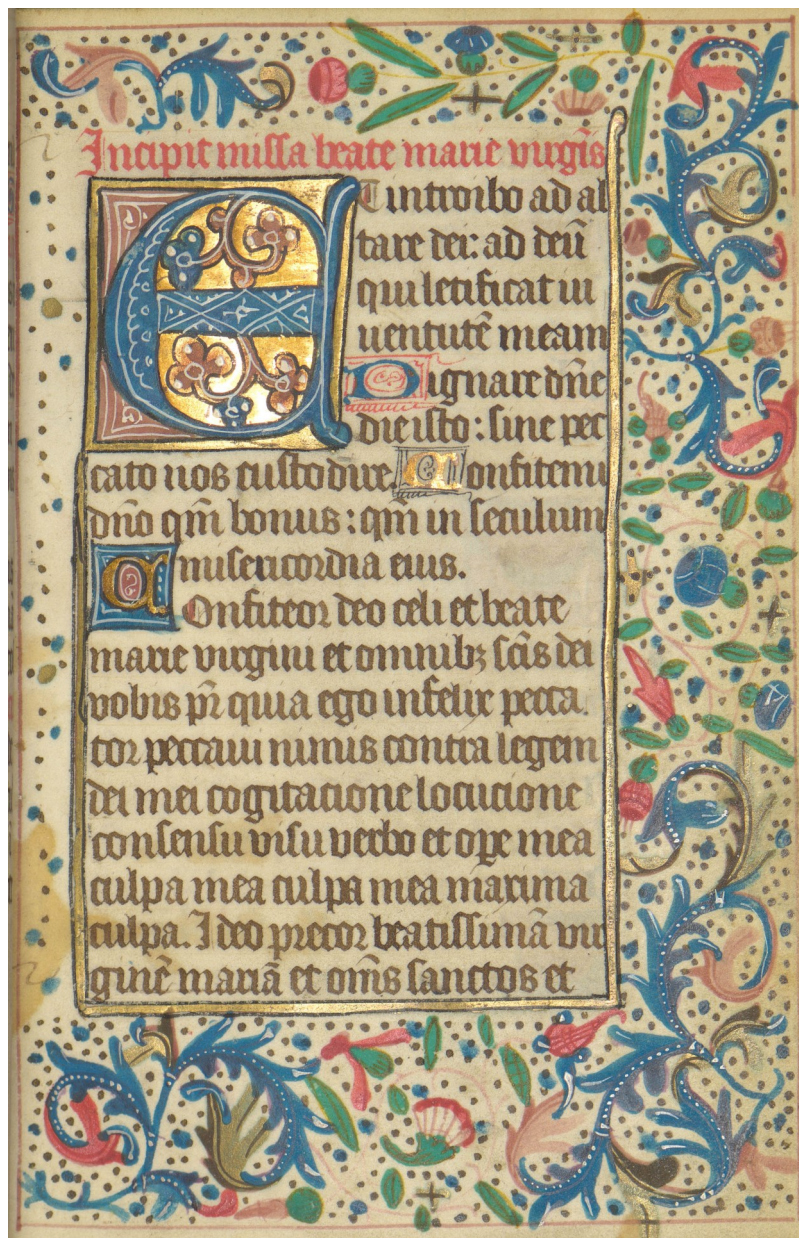
Book of Hours (fifteenth century) MS 370, New College Library, Oxford