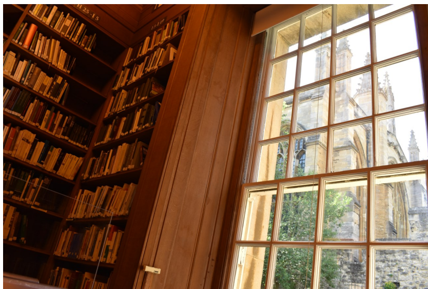
View of the Chapel from the Upper Reading Room, New College Library, Oxford

For Archive enquiries, please contact archives@new.ox.ac.uk .