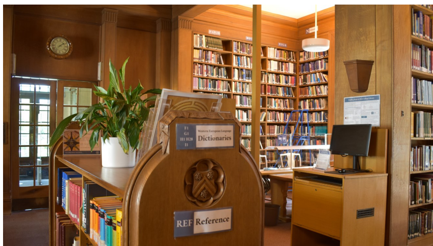
The Reference Section, New College Library, Oxford

These databases are listed alphabetically, by title, and the databases may also be searched by subject (from African Studies to Zoology) and by database type (e.g. full-text; images; maps).