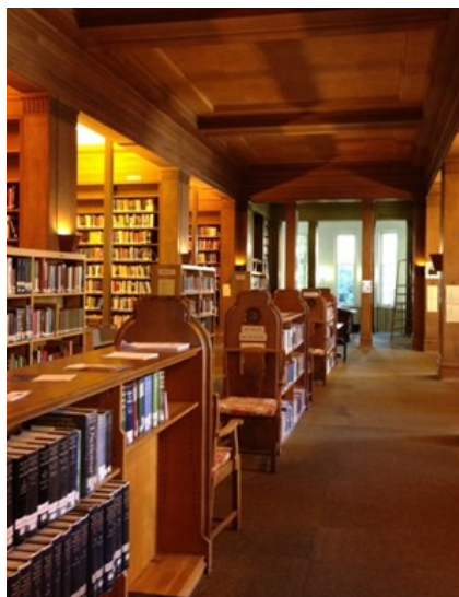
Upper Reading Room, New College Library, Oxford

New College has a considerable archive of historical papers, as well as a large collection of early printed books. If you would like to consult any of the pre-1850 material, please contact the Librarian .