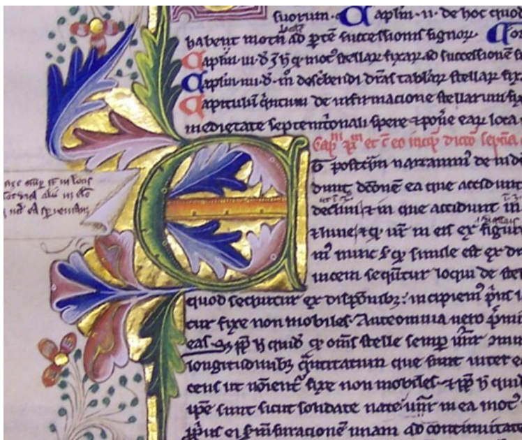
Ptolemy's Almagest (late 13th century) MS 281, New College Library, Oxford