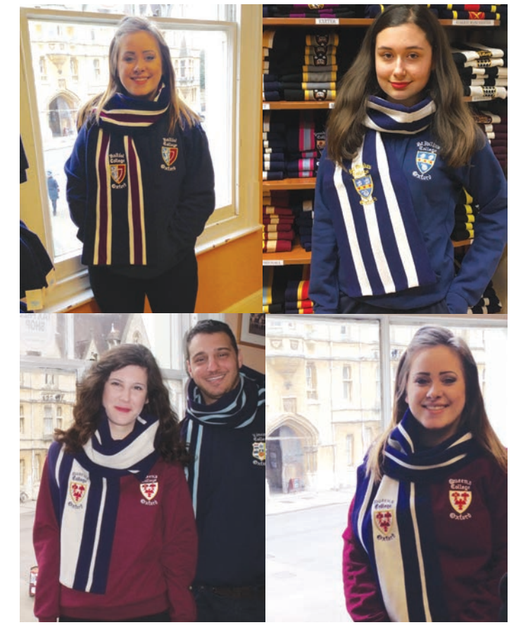
College Scarves + Hoodies