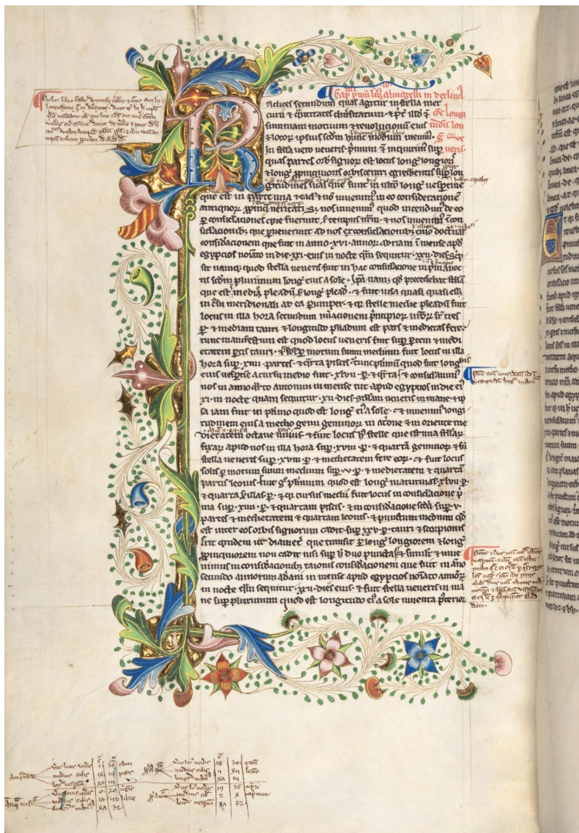
New College Library, Oxford, MS 281, f. 170v—the work of artist B