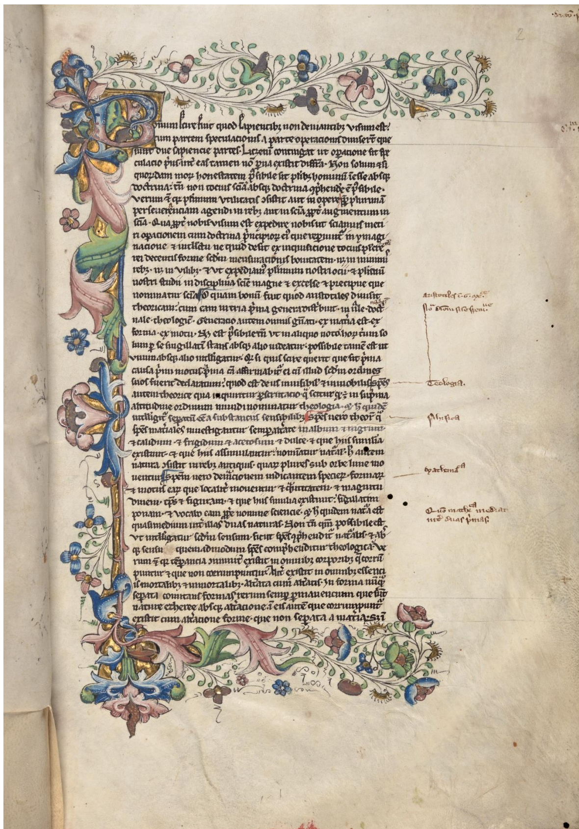
New College Library, Oxford, MS 281, f. 2r—the work of artist A

adornment is general and was presumably the work of Artist B, drawing feather sprays north and south, sometimes with floral terminals in blue or carmine.