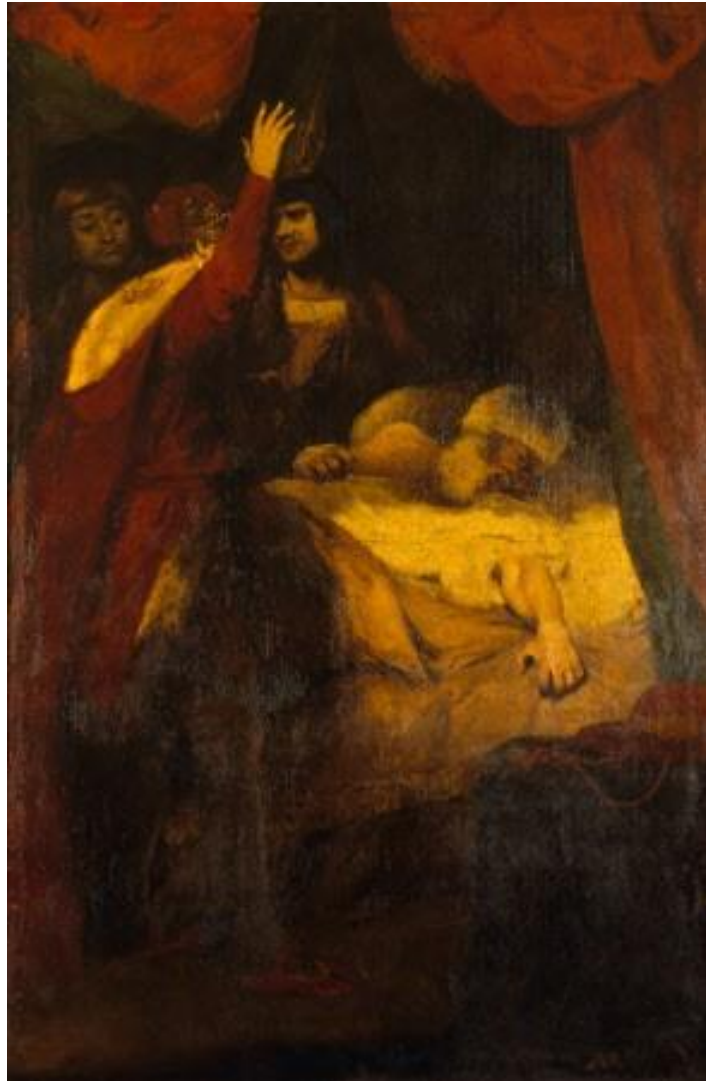
Sir Joshua Reynolds, The Death of Cardinal Beaufort (1377–1447), oil on canvas (1789) (from William Shakespeare’s Henry VI, Part II, Act III, Scene iii) Petworth House and Park, West Sussex