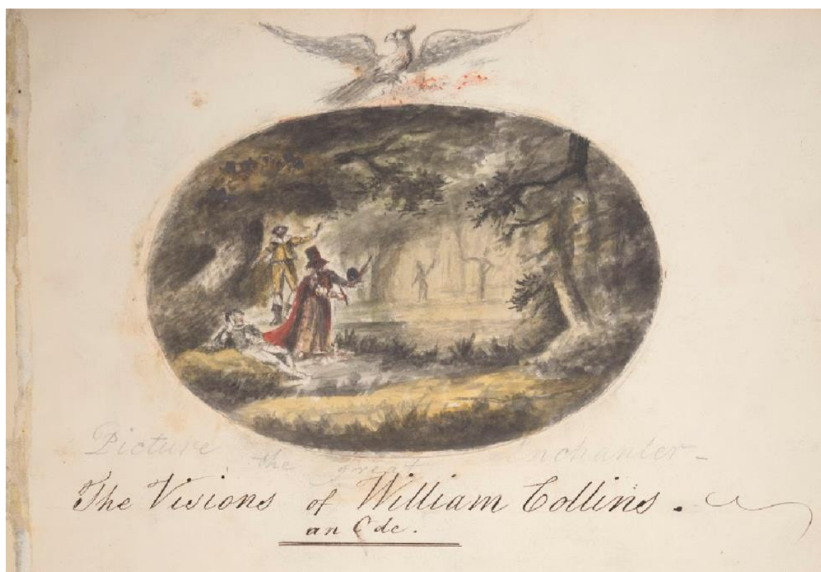
New College Library, Oxford, MS 367, f. 1r [detail]

With Shakespeare as mediator, Collins's dream is filled with isolated scenes from the playwright's dramas; he observes, as a slumbering spectator, such familiar moments as King Lear in the storm, Macbeth's meeting with the three witches, Juliet's death, or Jacques's soliloquising in the Forest of Arden. These scenes are all conjured by 'the great Enchanter', whose portrait appears on folio 1r of the manuscript; 'Picture, the great Enchanter' is written in faint pencil beneath the miniature. The strangely-named 'Picture' stands before the sleeping Collins in a red cloak, as Shakespeare, characterised with both beard and ruff, presides over the scene. As Picture raises his brush and palette, shadowy characters can be seen in the middle distance, conjured into being. As in the poem itself, Shakespeare's narratives gain life through the medium of this artist-magician, before the inner eye of William Collins.