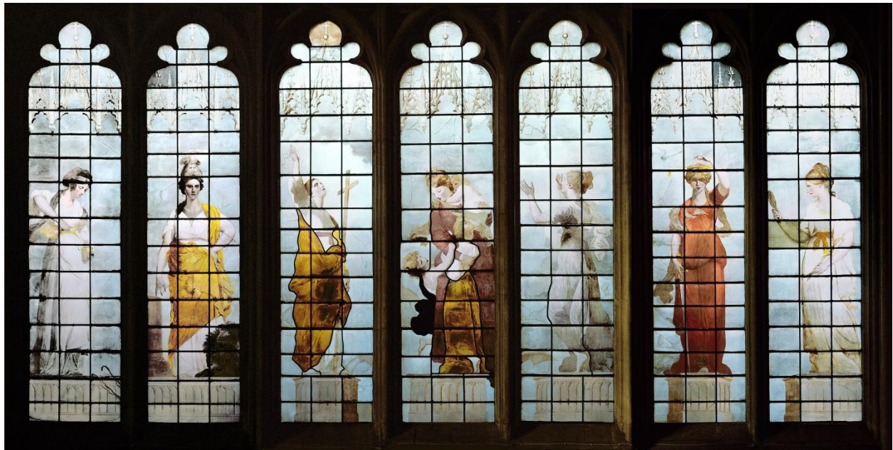
The Seven Cardinal Virtues, stained glass in the Antechapel of New College, Oxford Designed by Sir Joshua Reynolds and painted by Thomas Jervais (1779–85)

Perhaps it is fitting that the College's Committee on Women should have the last word in this retelling of the story of the 'battle for the admission of women'. The conclusion of the Committee on Women still resonates today—'We believe that only in a community in which the ratio between the sexes is not too far from 1:1 can benefits of a mixed society be fully achieved'.