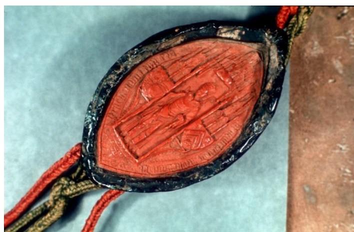
Seal from Founder's Statutes of Winchester College, Winchester College Archives, Winchester, WCM 21470

for binding the book. The book is mentioned against the total sum of 16 s. 8 d. in a memorandum aggregating extraordinary expenses in the early years of the College's existence (which includes the very large total outlay of £43 10 s. 1 d. on books). 14 Perhaps it had been given some sort of limp or makeshift cover, and it was decided fifty years later that something of greater dignity was required; perhaps it was simply through continual handling that the binding stood in need of repair by the middle of the century. Whatever the reason, Thomas Bokebynder, the College's normal choice of binder at this time, was brought in to bind it anew. According to the Bursars' Roll for 1451–2, a skin was acquired for the work along with silk for the 'garnishing'. 15 The binding is a reverse skin, perhaps pig, over pasteboard, with a wrap-around flap and three ties of plaited red silk. The stitching is very fine. The seal of the Founder, Bishop Wykeham, is pendant from the spine-fold on a thick plaited cord of red and green silk. The cost of the work, totalled with repairs to a great legendary and a small antiphoner, was 11 s. 4 d.