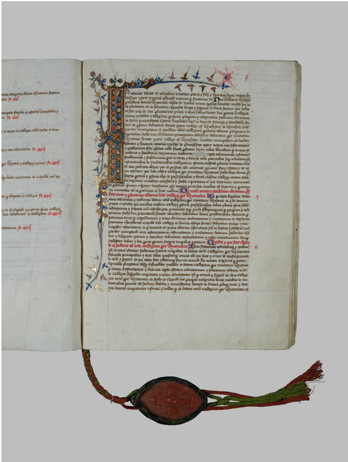
Page 1, Founder's Statutes of Winchester College, Winchester College Archives, Winchester, WCM 21470