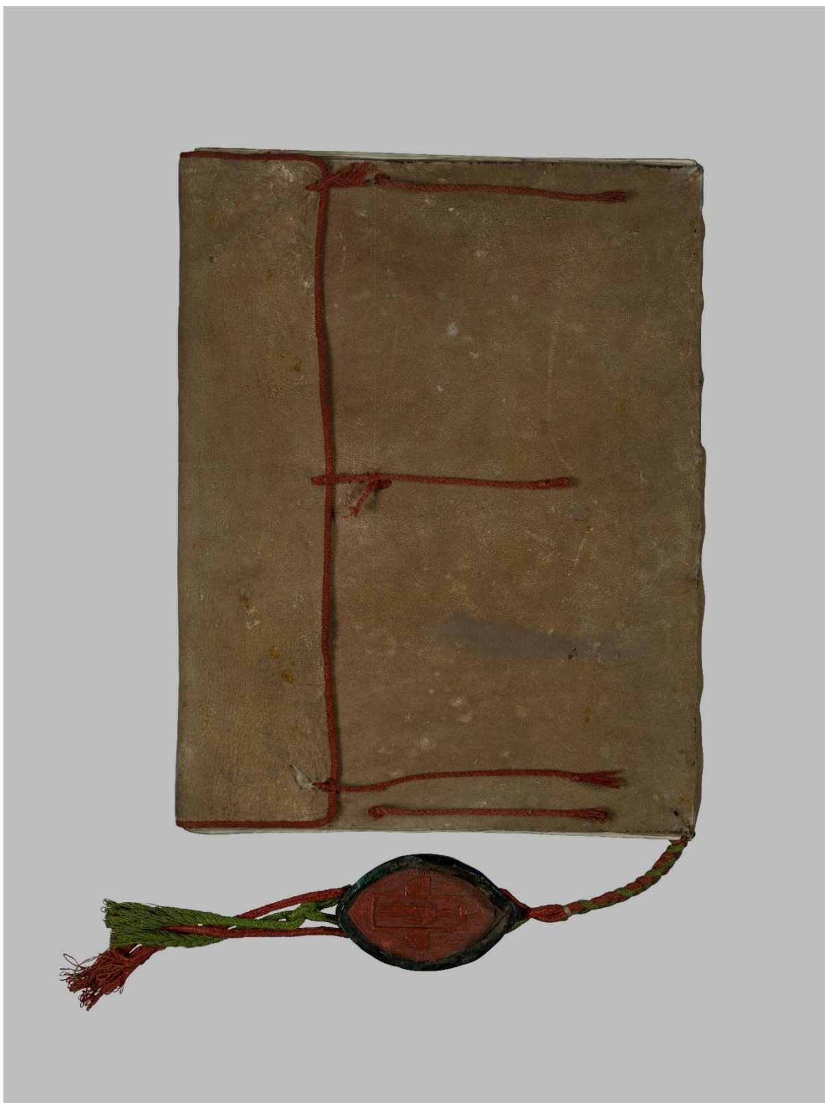
Binding for the Founder's Statutes of Winchester College, Winchester College Archives, Winchester, WCM 21470