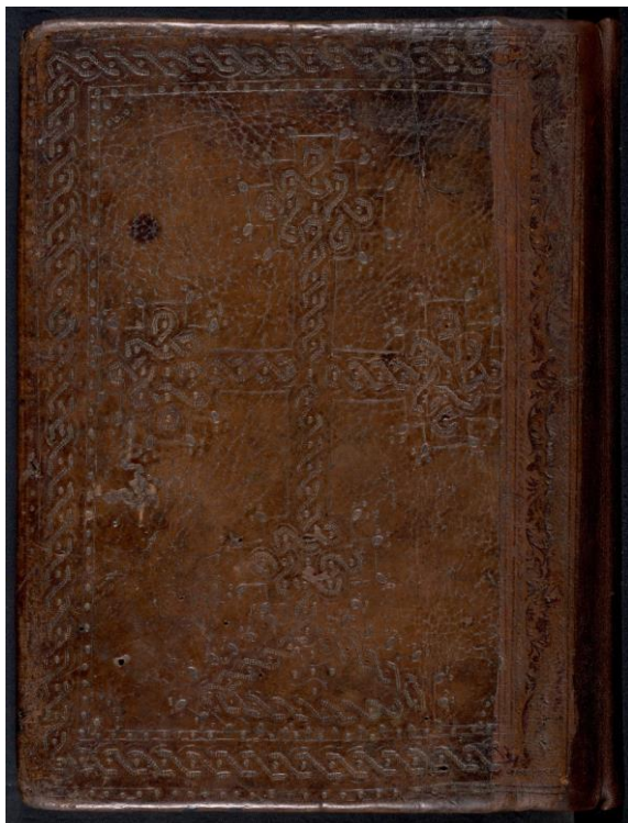
MS 333, binding, front board exterior