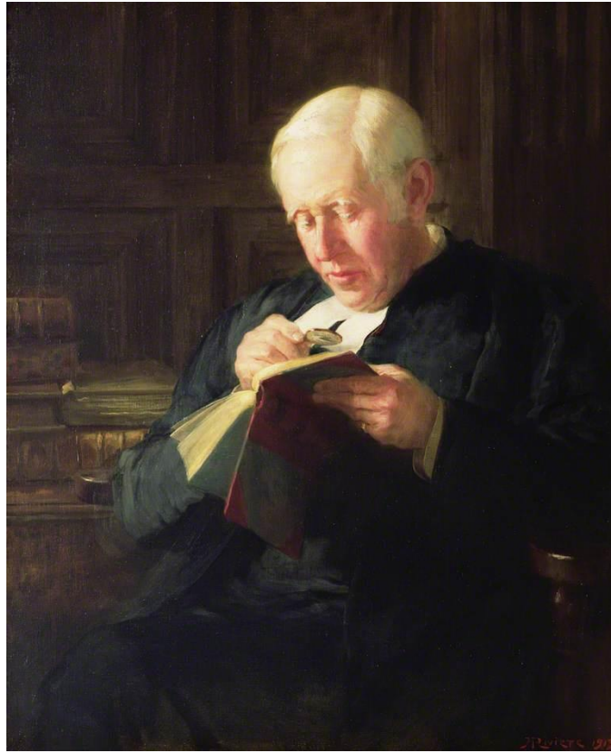
Spooner's Portrait, which hangs in Hall