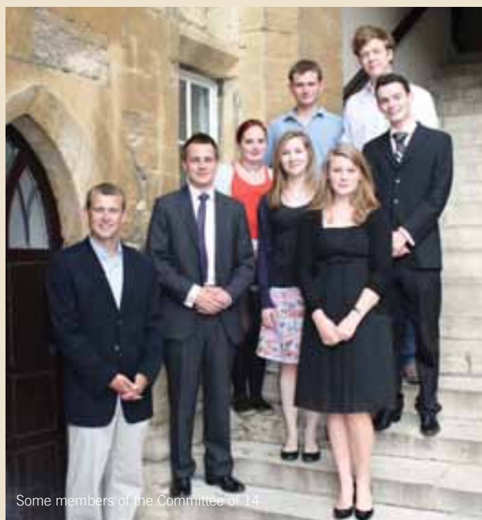
Some members of the Committee of 14

Of particular note last year was the completion of the library box project. All manuscripts in the College's collections have a custom-made conservation-quality box in which they can be stored safely. Not one to rest on her laurels, the Librarian tells me the next project is to conserve the collection of incunabula held by the College. It is thought to be one of the most important collections of early books in any Oxford college library, so your continuing support and involvement will be much appreciated.