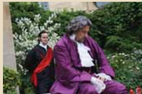
This year New Chamber Opera performed Francesco Cavalli's Erismena written for performance in Venice in 1655. This was a very special production for many reasons, but central to it was a new edition of the opera based on a manuscript newly purchased by the Bodleian Library in Oxford. The manuscript dated from about 1670, and was a key work in the history of English opera, having an underlying English singing translation and therefore the first surviving opera text in English.