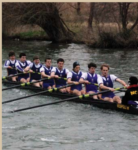
The Men's 1st VIII about to bump Exeter College on the Saturday of Torpids 2009 to win Blades.