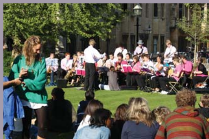
A summer evening of Jazz in the College garden. New College students playing and enjoying.